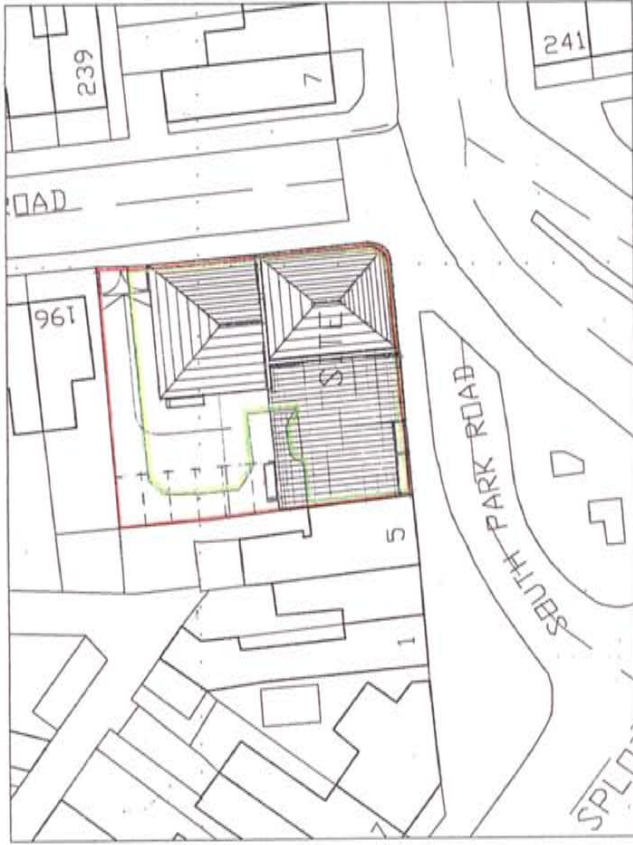
SITE and ROOF PLAN